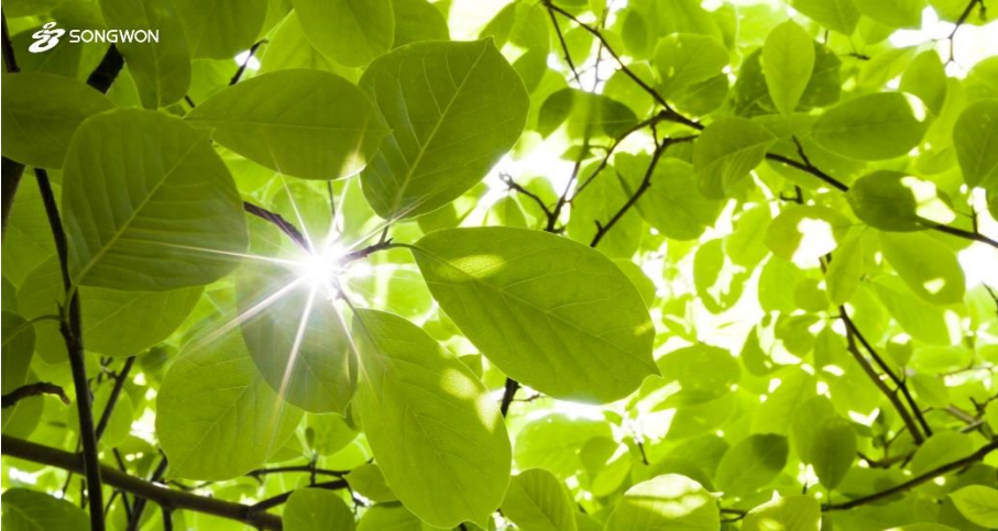
SONGWON signs The Antwerp Declaration for a European Industrial Deal.